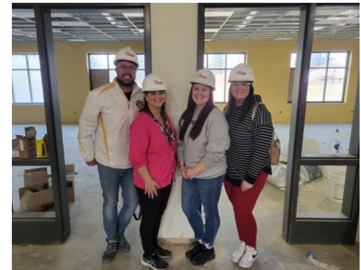
The 3 rd grade team standing outside 2 of our new classrooms.

http://www.southeast.k12.oh.us/district/school-building-project